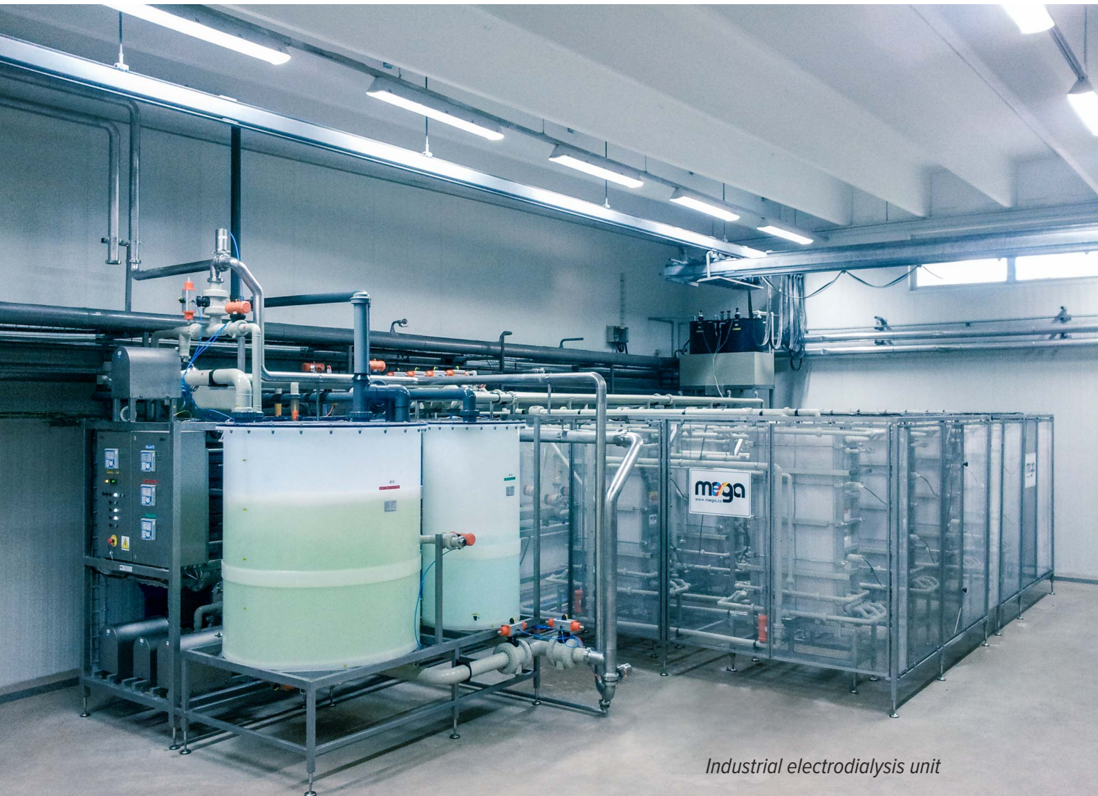
Industrial electro dialysis unit

Business activity in the aftersales segment was stable throughout 2020, with sales in this segment gradually increasing.