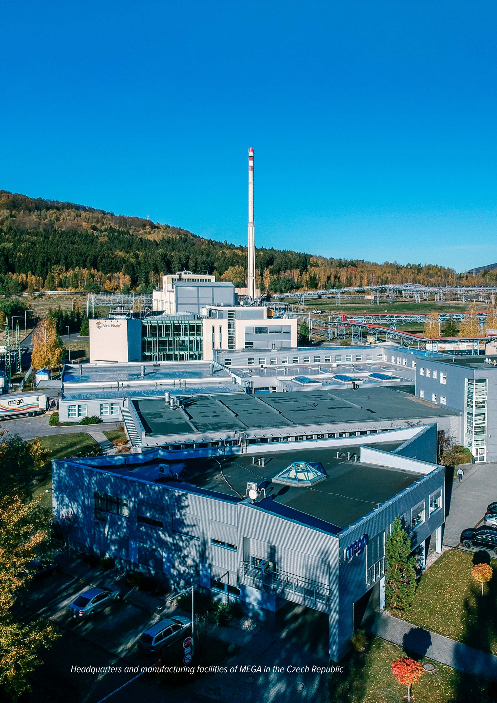
Headquarters and manufacturing facilities of MEGA in the Czech Republic