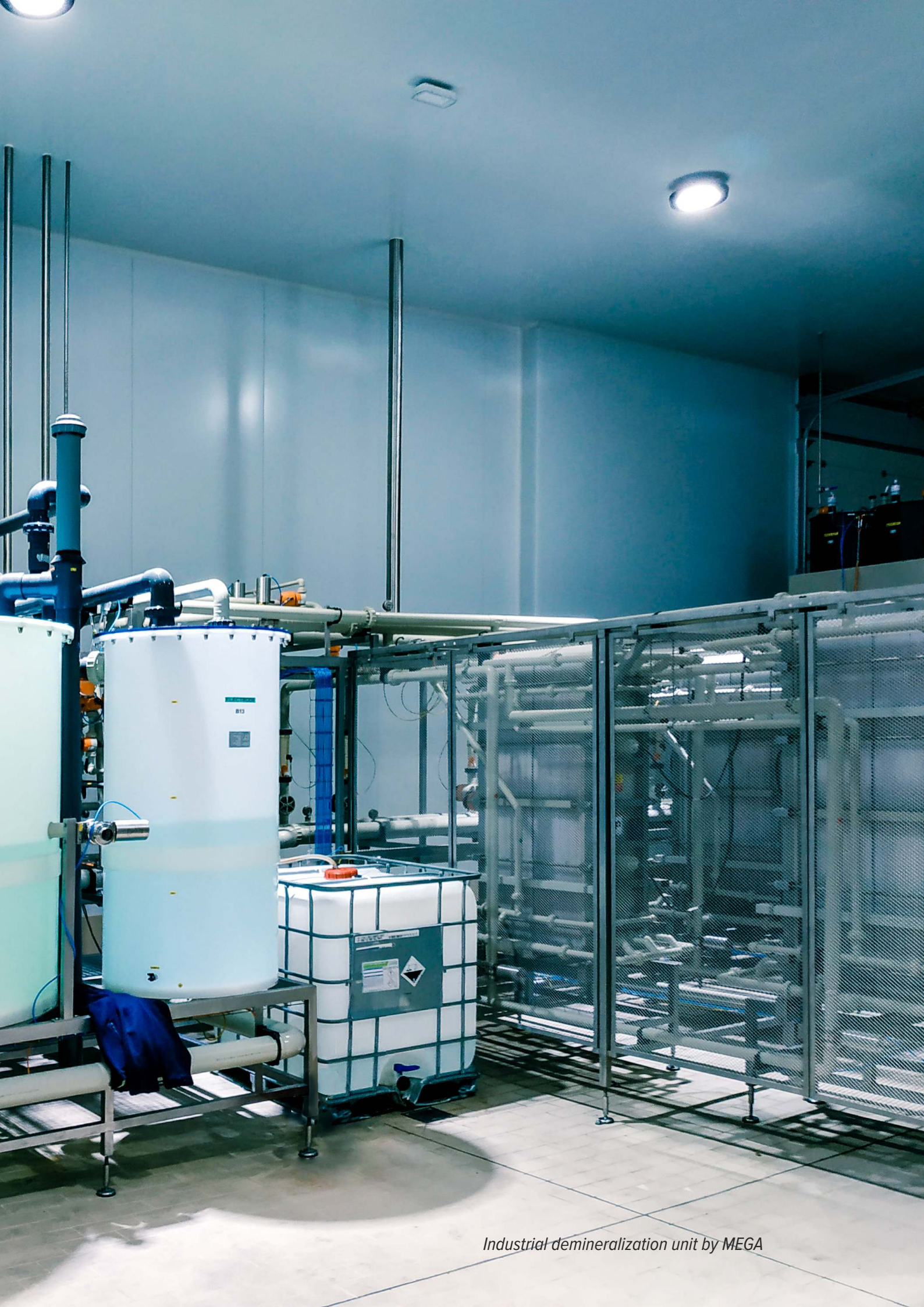
Industrial demineralization unit by MEGA