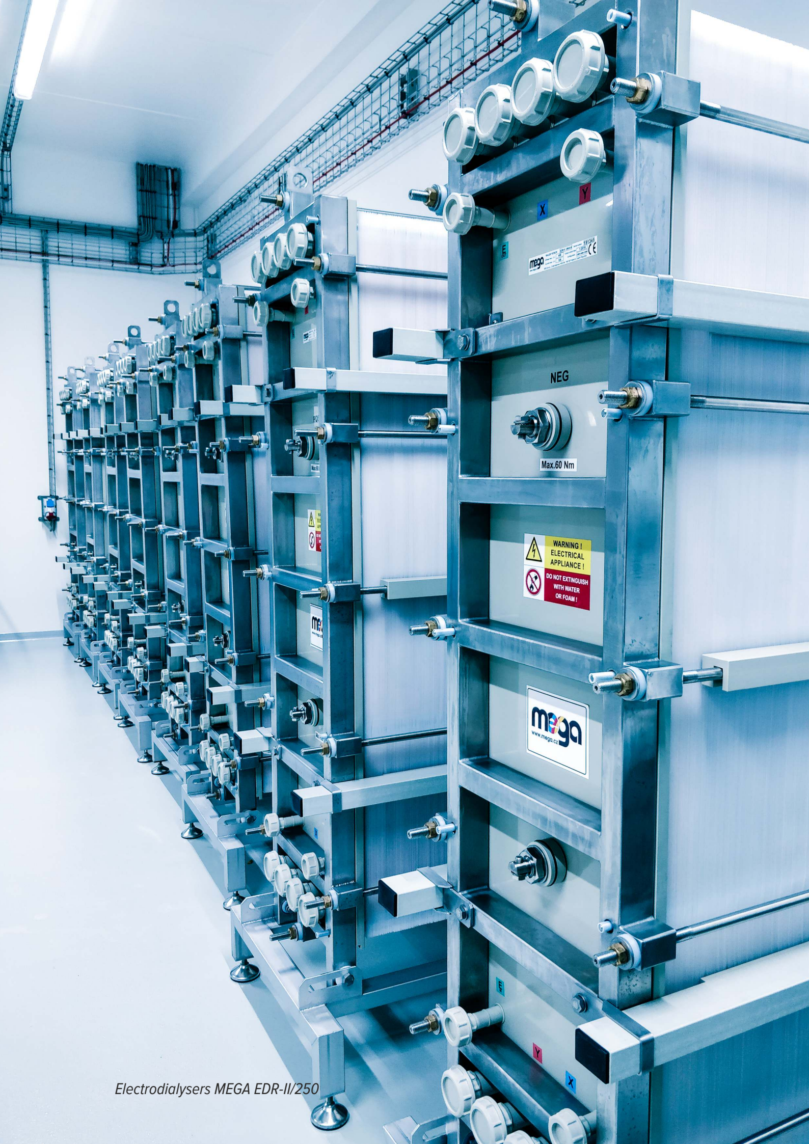
Electrolysers MEGA EDR-II/250